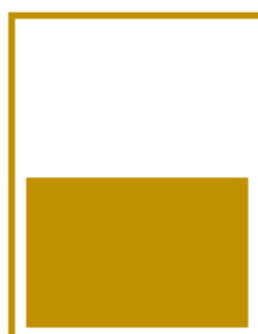
HALF PAGE Type area - 18.5 cm x 11 cm Trim size - 21 cm x 13.5 cm Bleed size- 21.6 cm x 14 cm