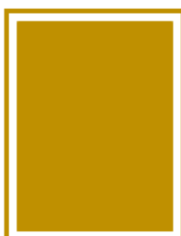
FULL PAGE Type area - 18.5 cm x 21.9 cm Trim size - 21 cm x 27 cm Bleed size- 21.6 cm x 27.6 cm